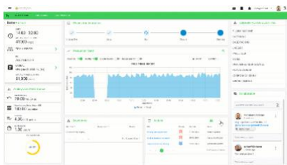
Interactive Shop Floor OEE Board